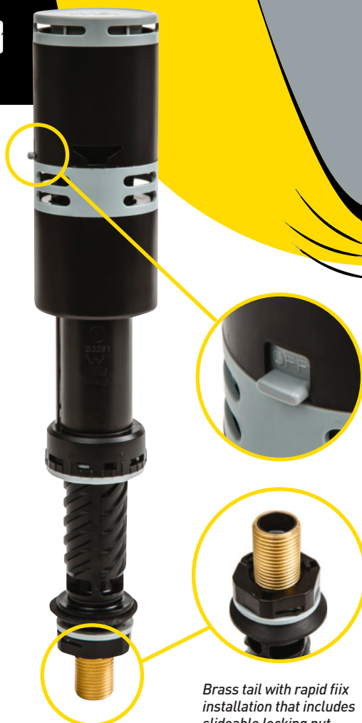
Brass tail with rapid fix installation that includes slideable locking nut